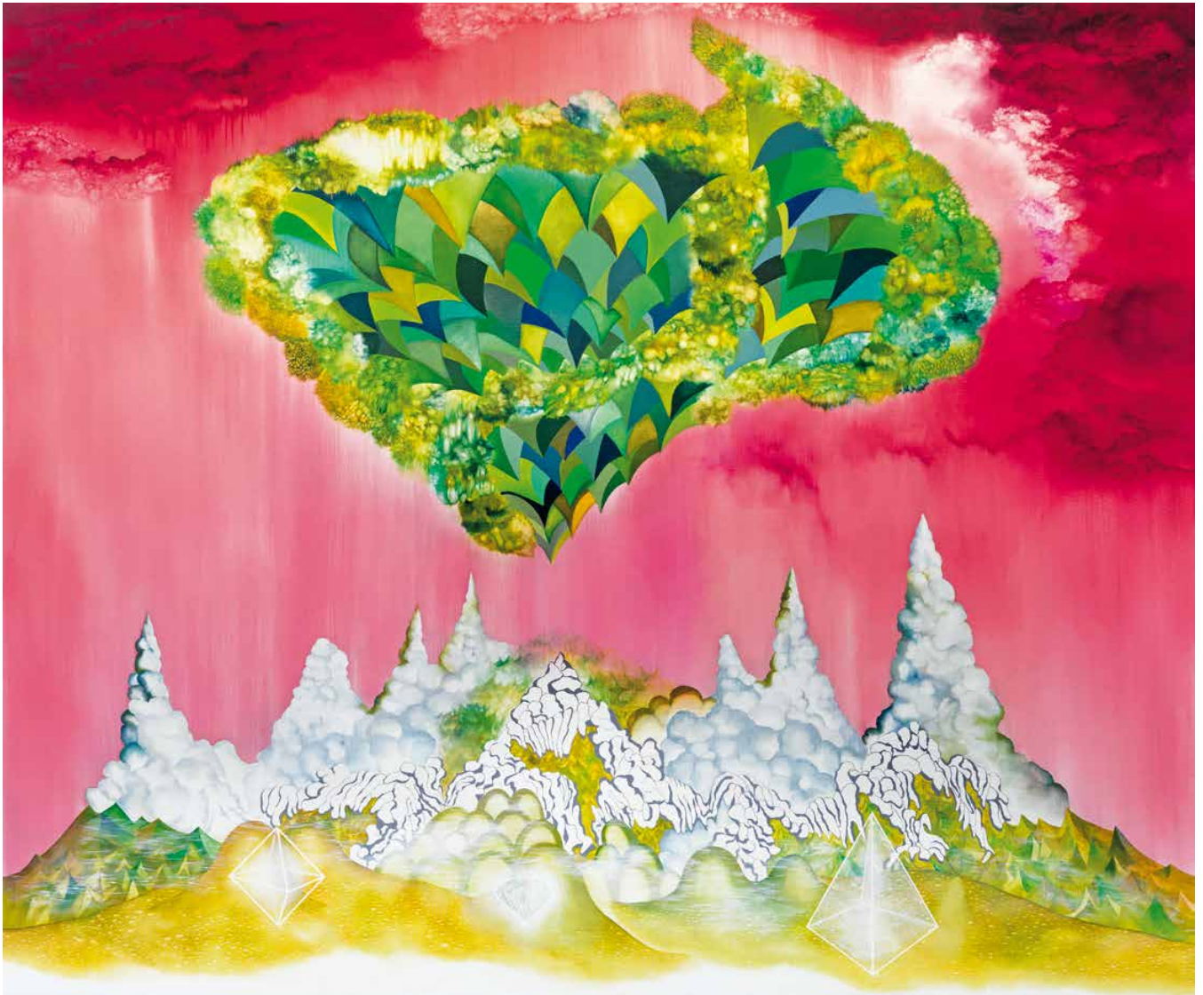
VISION OF THE FUTURE, 2014 OIL ON CANVAS 153 X 183 CM

Tung Ch'i-Ch'ang - painter/scholar (1555 -1636)