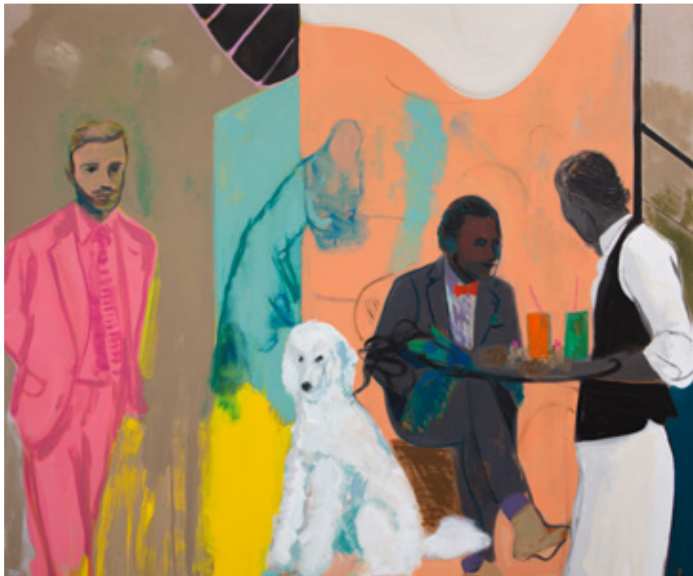
Music For Chameleons, 2022, Oil on Linen, 150 x 180cm, £9,500