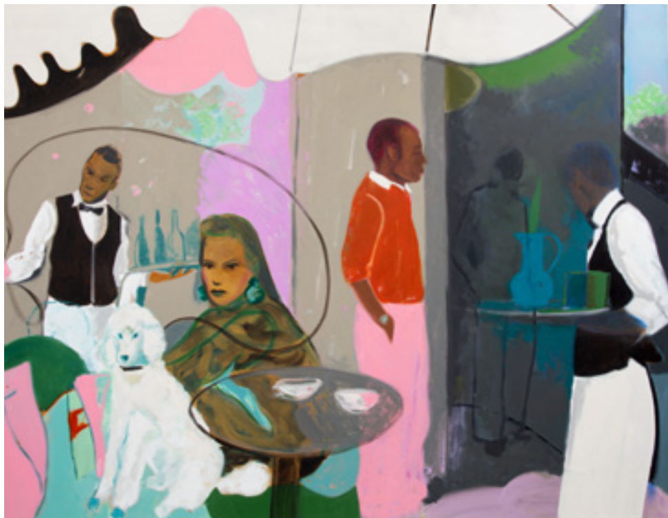
Cafe Society , 2022, Oil on Linen, 170 x 220cm, £11,000