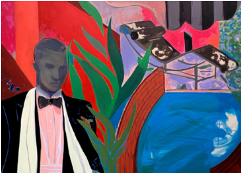
The Postgraduate, 2022 , Oil on Linen, 150 x 200cm, £10,000