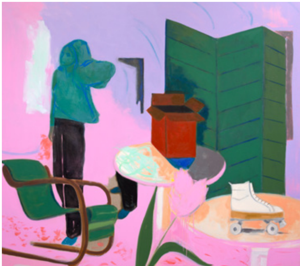
The Present (take the box) , 2022, Oil on Linen, 160 x 190cm, £9,500