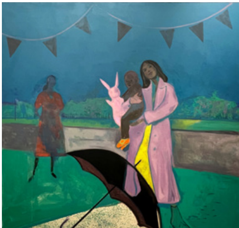
Starting Him Early, 2022 , Oil on Linen, 190 x 180cm, £10,000