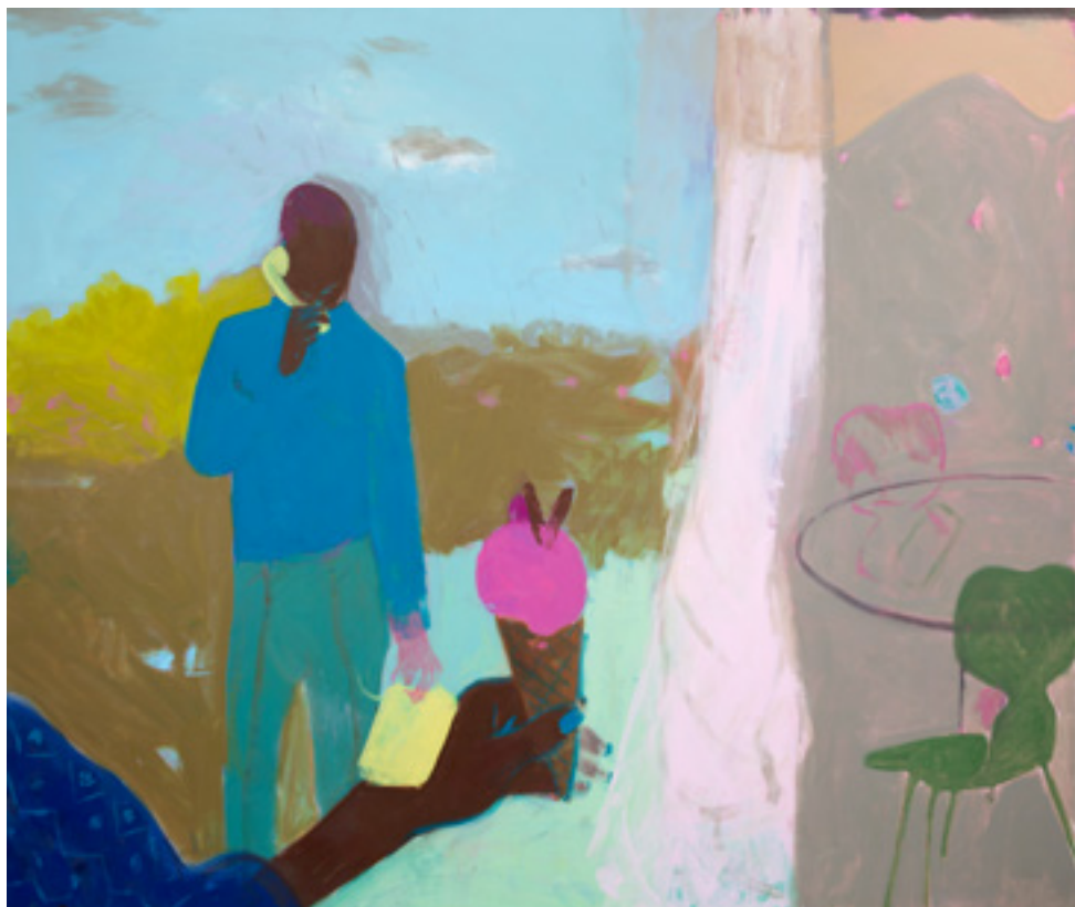
Home Sickness, 2022, Oil on Linen, 160 x 190cm, £9,500