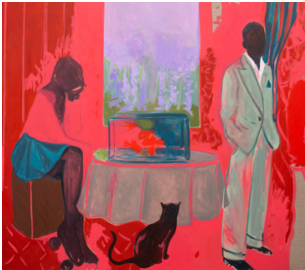
Roller Skating into Bohemia, 2022, Oil on Linen, 160 x 190cm, £9,500