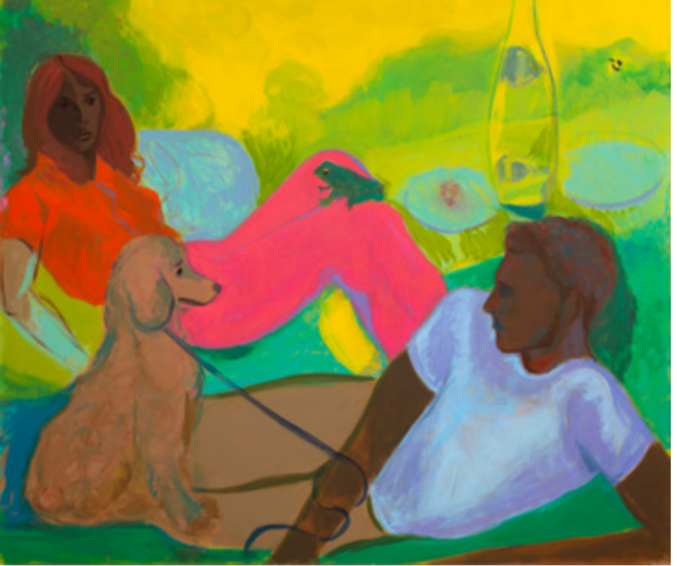
Good Boys Get Treats , 2022, Oil on Linen, 140 x 160cm, £8,500