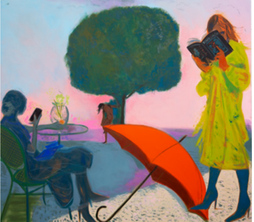
Canopy , 2022, Oil on Linen, 160 x 190cm, £9,500