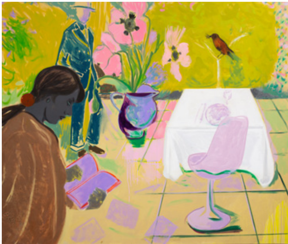
The Pleasure of Solitary Dining , 2022, Oil on Linen, 150 x 180cm, £9,000