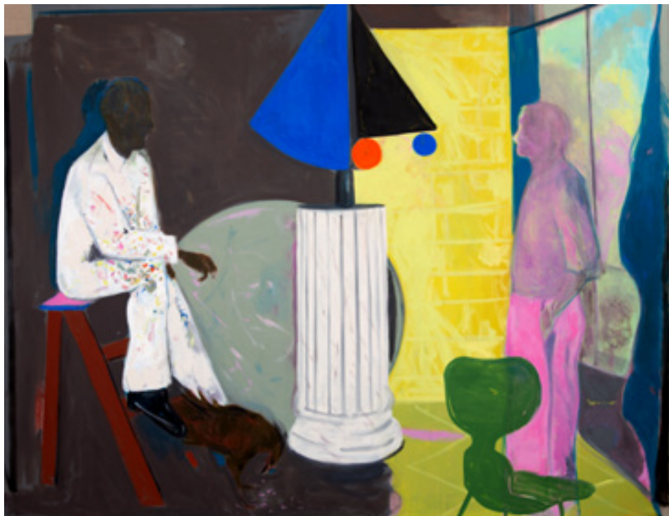
The Mute Swan , 2022, Oil on Linen, 150 x 180cm, £9,000