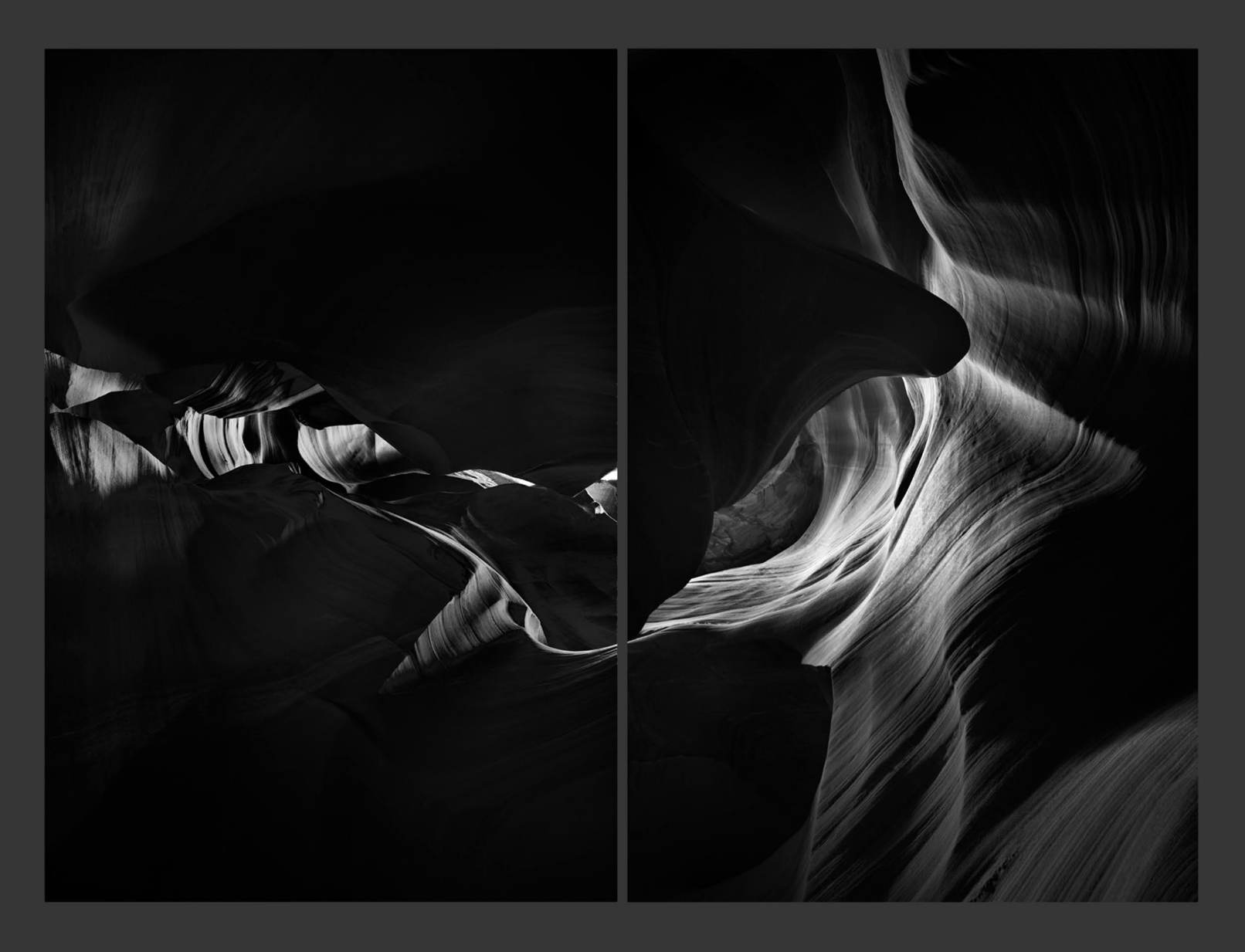
Arizona Hollows 11:05, 01:01 Silver gelatin hand-prints Diptych of two; each print 30 x 20 in. Edition of five, 2016 Supplied framed with museum glass £8,500 inc. VAT