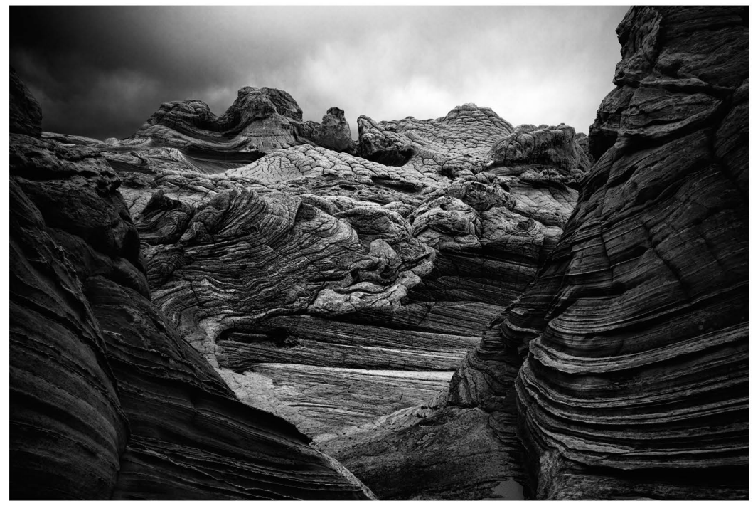
Sabara 07:54 Silver gelatin hand-prints 20 x 30 in. Edition of five, 2016 Supplied framed with museum glass £5,000 inc. VAT