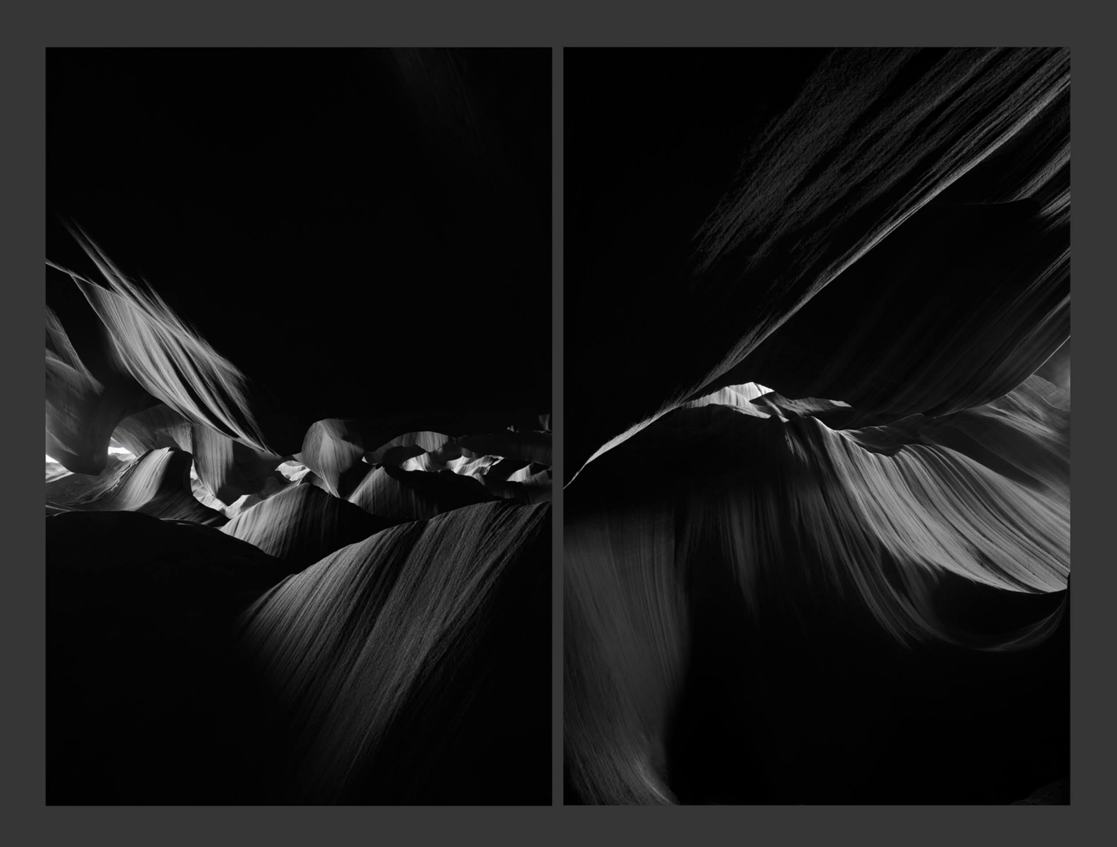
Arizona Hollows 11:27 and 01:26 Silver gelatin hand-prints Diptych of two; each print 30 x 20 in. Edition of five, 2016 Supplied framed with museum glass £8,500 inc. VAT