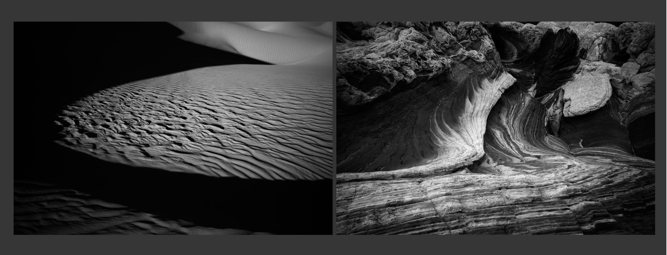
Sahara 08:33, Utah 23:38 Silver gelatin hand-prints Diptych of two; each print 20 x 30 in. Edition of five, 2016 Supplied framed with museum glass £8,500 inc. VAT