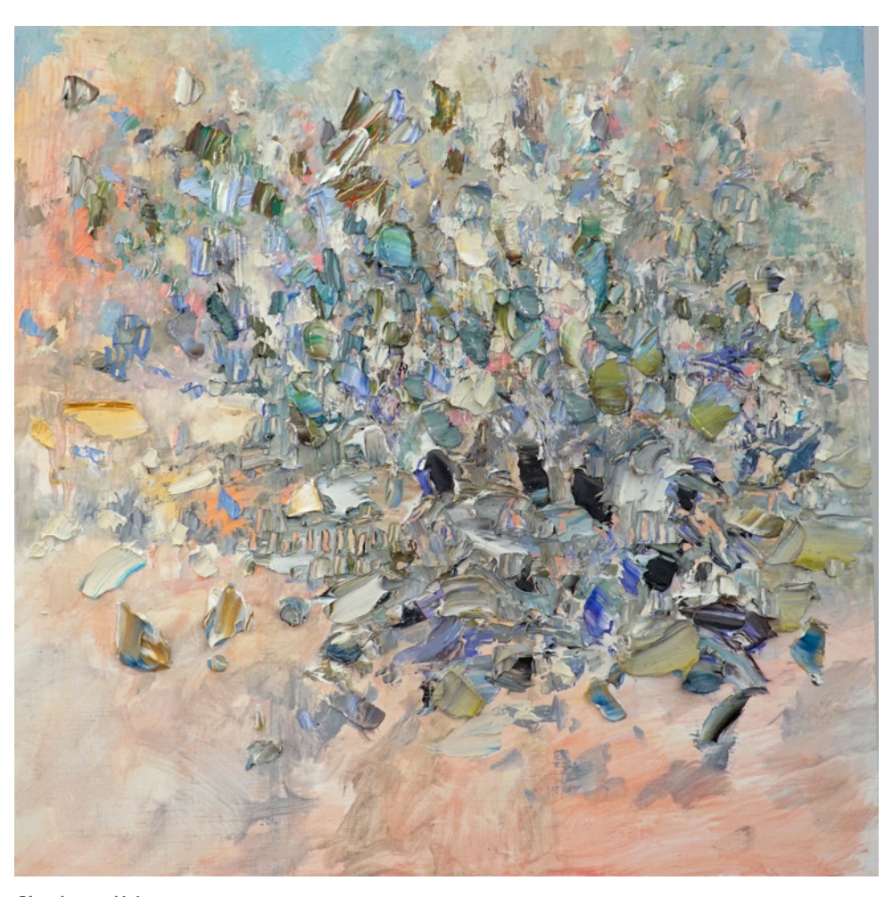
Cicadas and Waves, 2022, oil on board, 47 x 47cm, £2,600