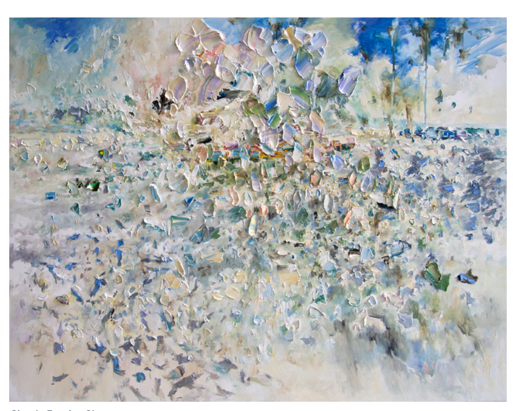
Cicada Evening Chorus, 2022, oil on linen, 89 x 116cm, £7,200