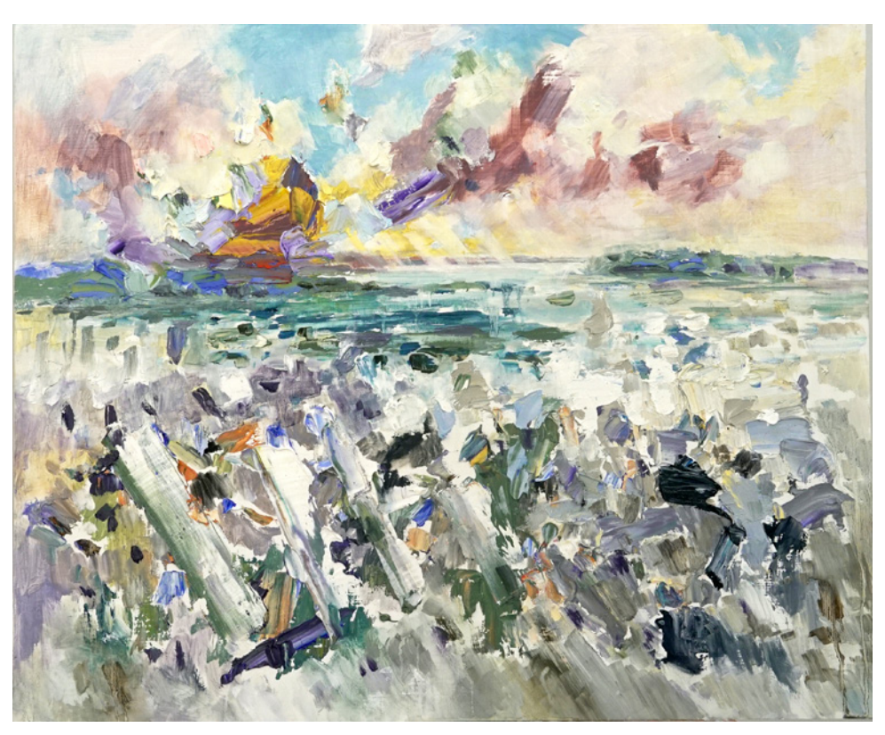
After the Mistral, 2022, oil on board, 47 x 57cm, £3,000