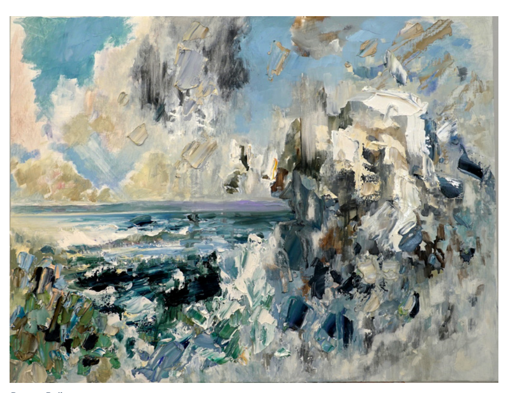
Roman Relic, 2022, oil on linen on board, 47 x 62cm, £3,500