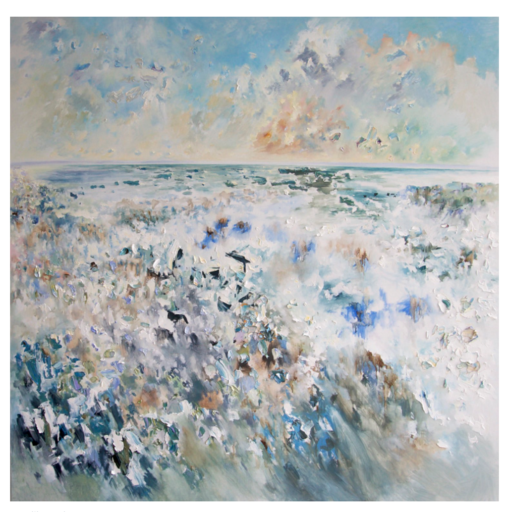
Familiar Voices, 2022, oil on linen, 200 x 200cm, £20,500