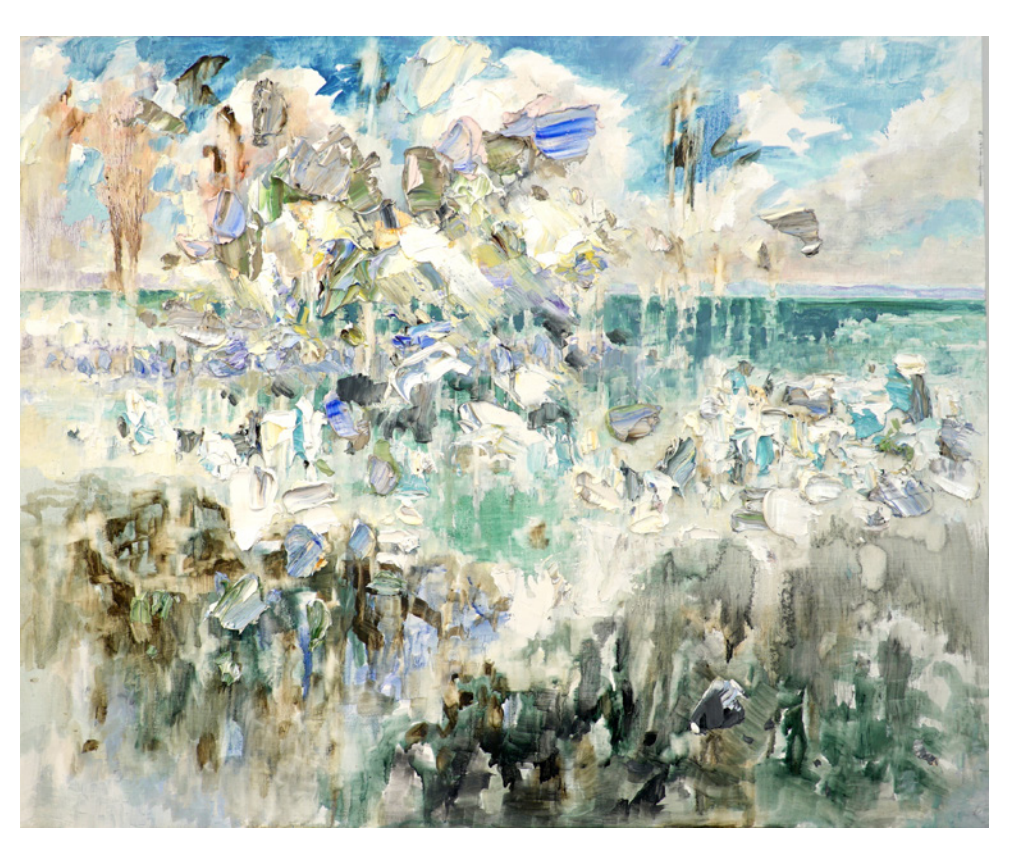
From Baux to Marseille and Home, 2022, oil on board, 47 x 57cm, £3,000