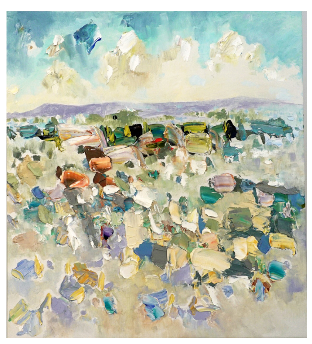
Outlaws of Arles, 2022, oil on linen, 55.5 x 50.5cm, £3,100