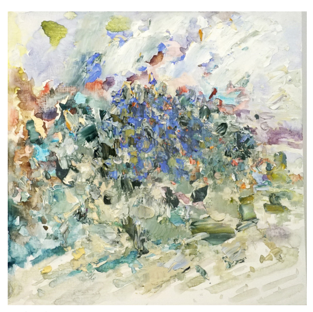
Lost Vineyard, 2022, watercolour and oil on board, 47 x 47cm, £2,600