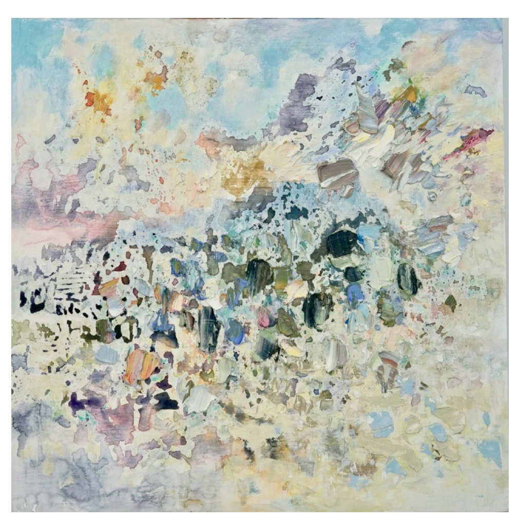
View Before Baux, 2022, watercolour and oil on board, 47 x 47cm, £2,600