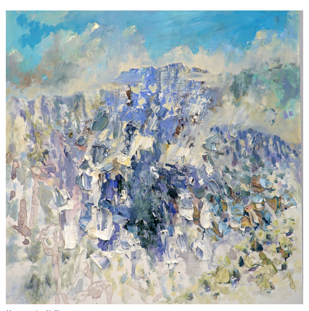
Maussane les Alpilles, 2022, watercolour and oil on board, 47 x 47cm, £2,600