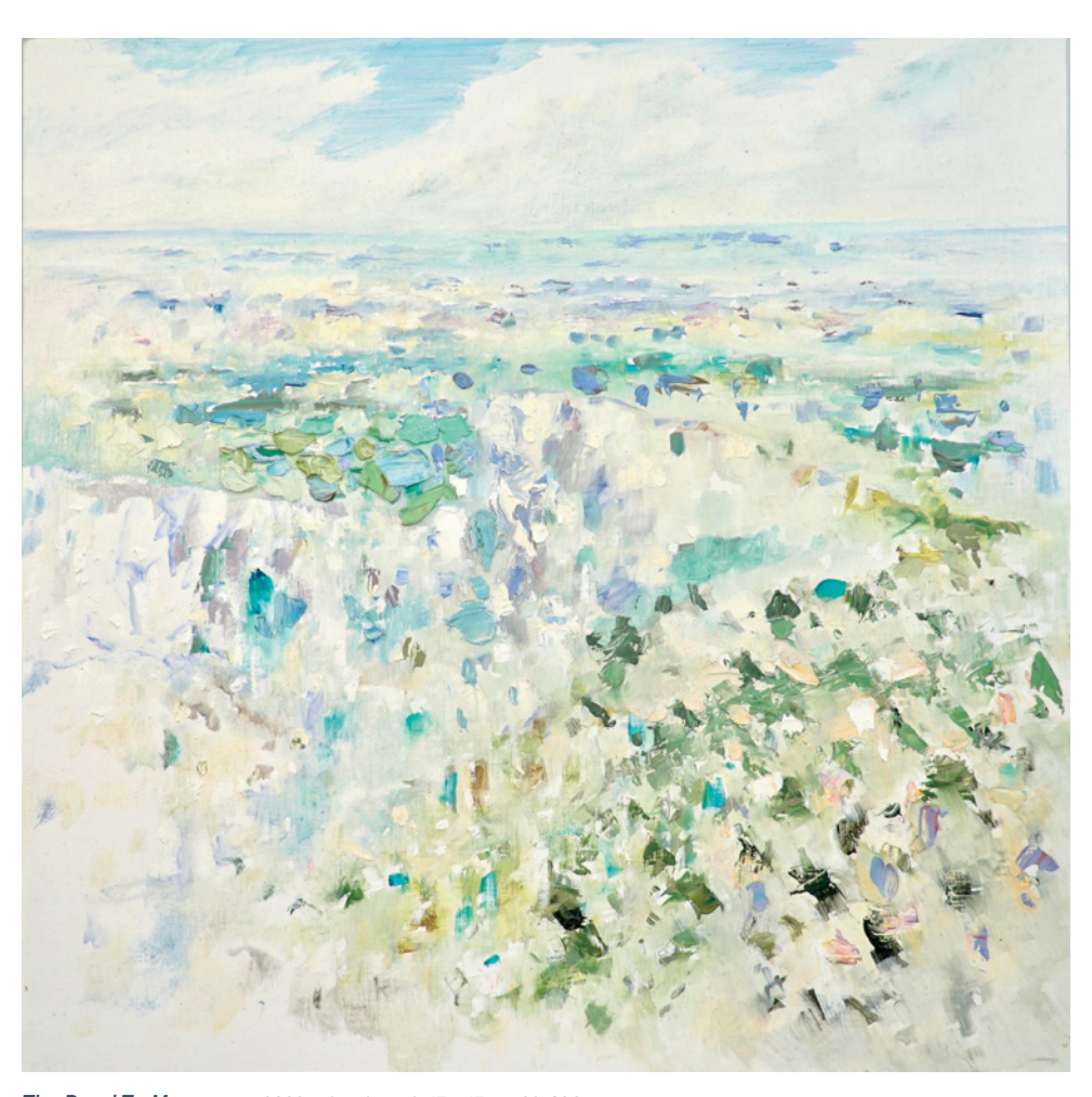
The Road To Maussane, 2022, oil on board, 47 x 47cm, £2,600