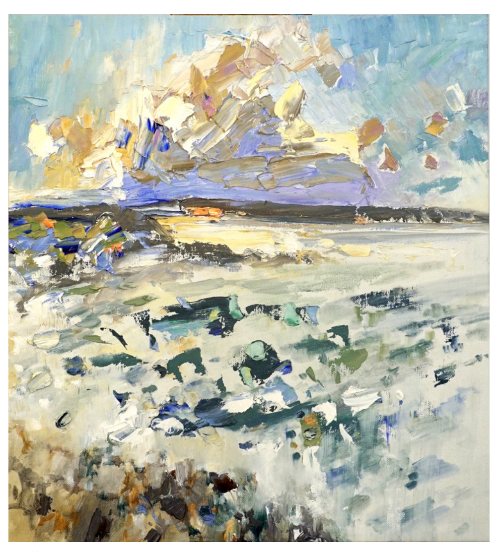
French Coast, 2022, oil on linen, 55.5 x 50.5cm, £3,100