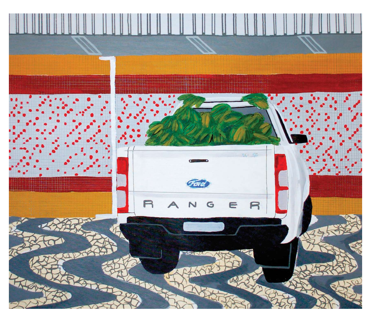
Ranger, 2018 Mixed Media on Canvas 65 x 76 cm

"I found Brazil extremely inspiring. I've attempted to paint moments and memories that highlight those same feelings of joy, serenity and an honest representation of the energetic, often iconic nature of Brazilian culture."