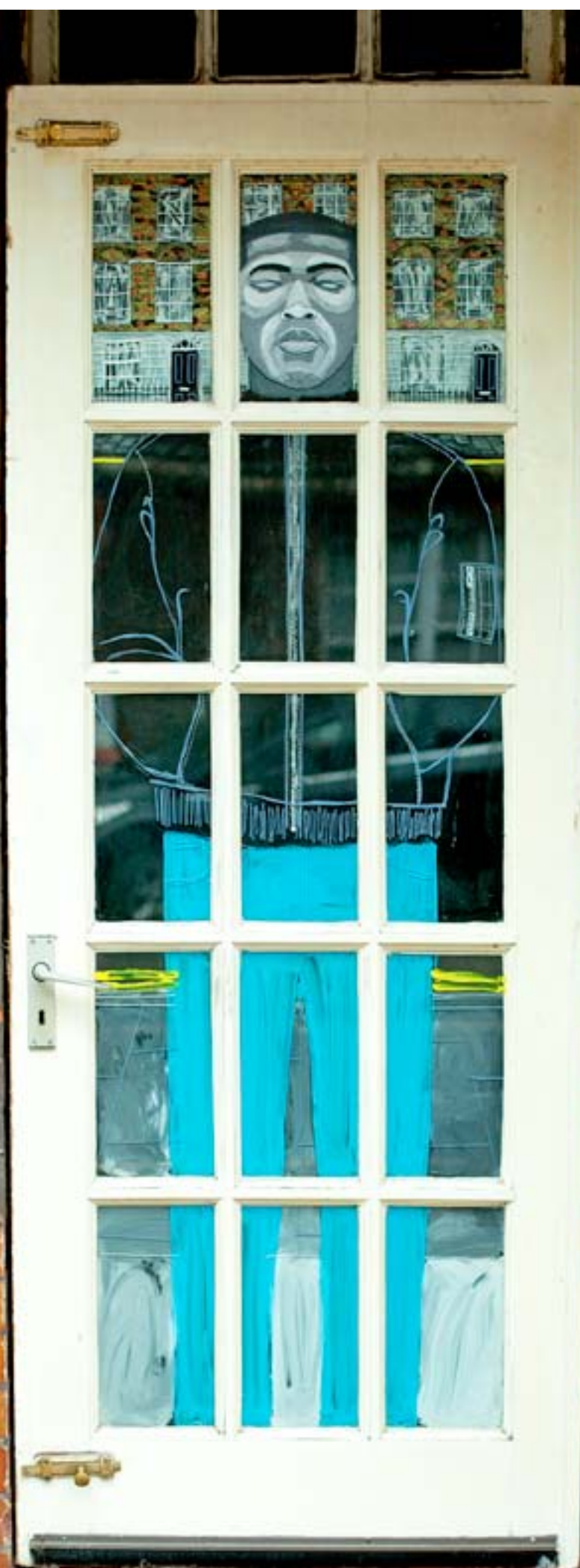
Rachmanism and The Boogey Men: St Maurice 2016 mixed media on glass 204 cm x 82 cm £7,000 Ex VAT

“I wanted to explore the narrative of housing in London - Rachmanism was an obvious choice, stories of exploitation, intimidation, opportunity and hope, all played their part in laying the early foundations to life in Britian for many Afro-Caribbean families” - Barka