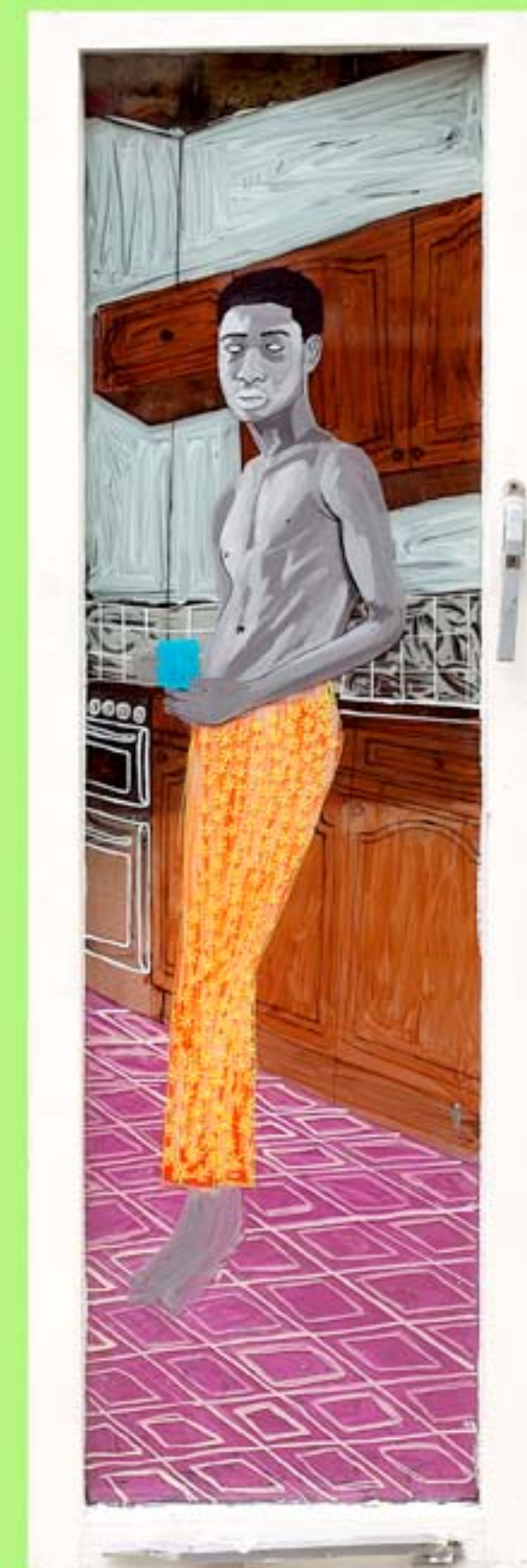
Earl Grey , 2016 mixed media on glass 123 cm x 42 cm £4,250 Ex VAT