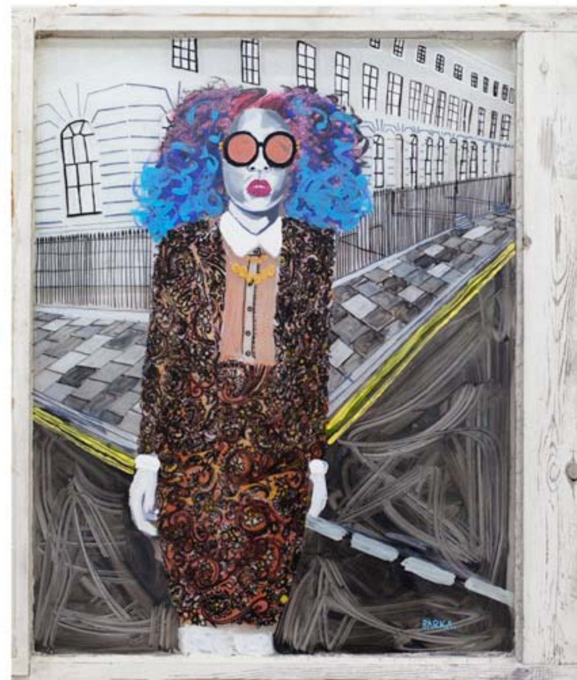
Trinity Street. 2015 mixed media on glass 97 cm x 73 cm £6,000 Ex VAT