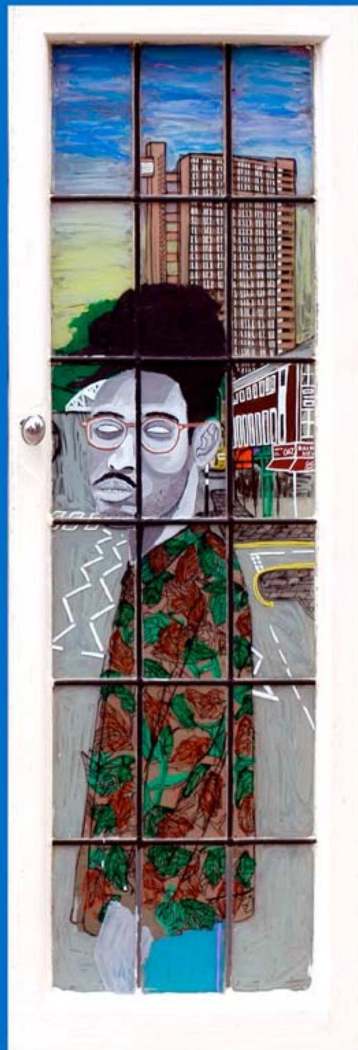
Gold Finger , 2016 mixed media on glass 114 cm x 38 cm £3, 800 Ex VAT