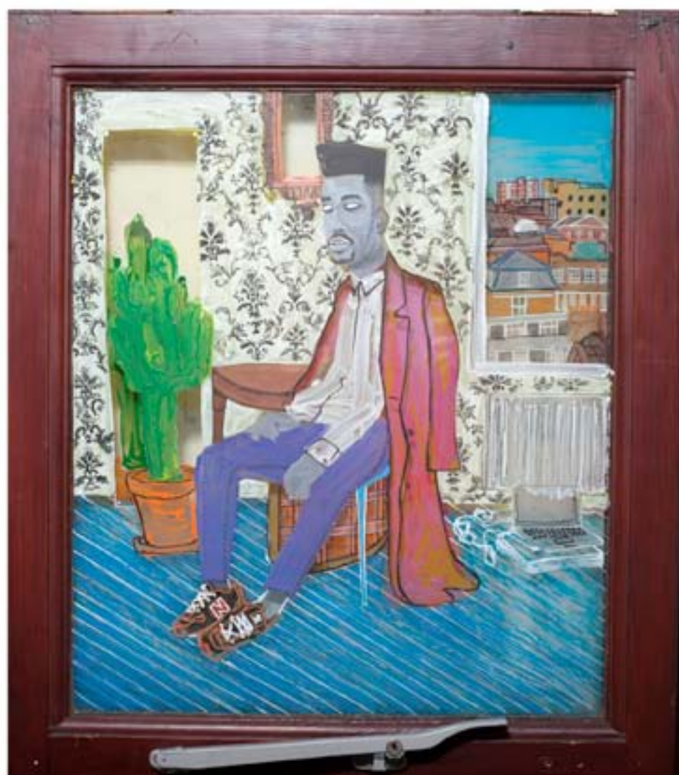
Nag Champa . 2016 mixed media on glass 55 cm x 63 cm £4,000 Ex VAT