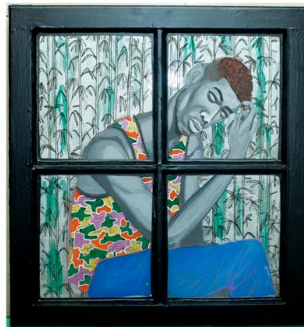
Hybrid. 2016 mixed media on glass 56 cm x 53 cm £4,000 Ex VAT