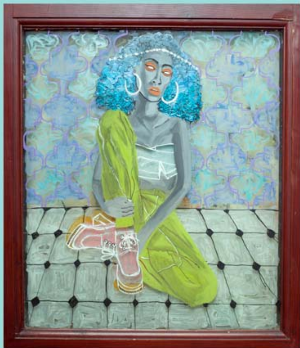
Serenity. 2016 mixed media on glass 55 cm x 63 cm £4,000 Ex VAT