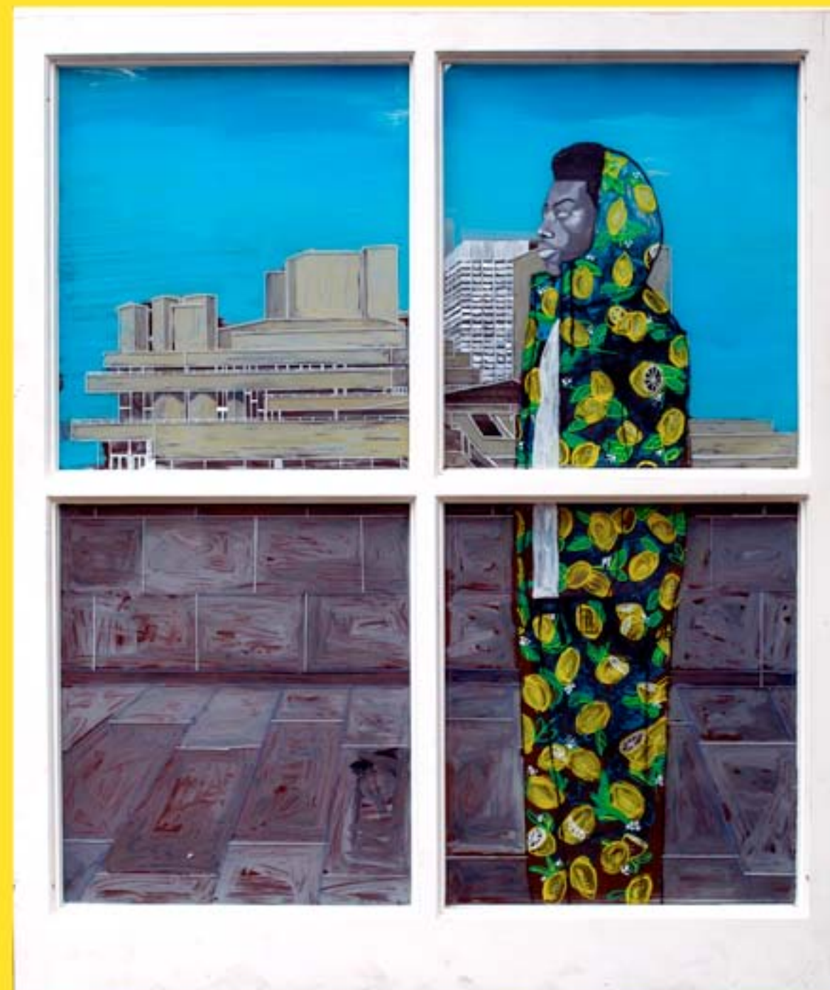
Got that Lemon , 2016 mixed media on glass 98 cm x 82 cm £6,000