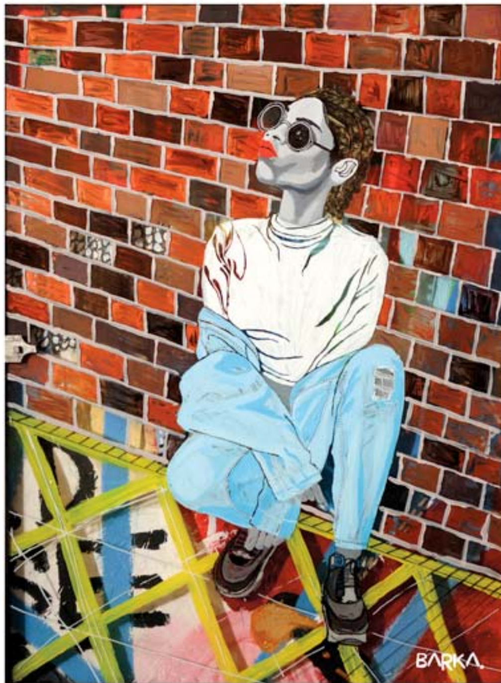
Jamie Dean. 2015 mixed media on glass 84 cm x 64 cm £ 4, 800 Ex VAT