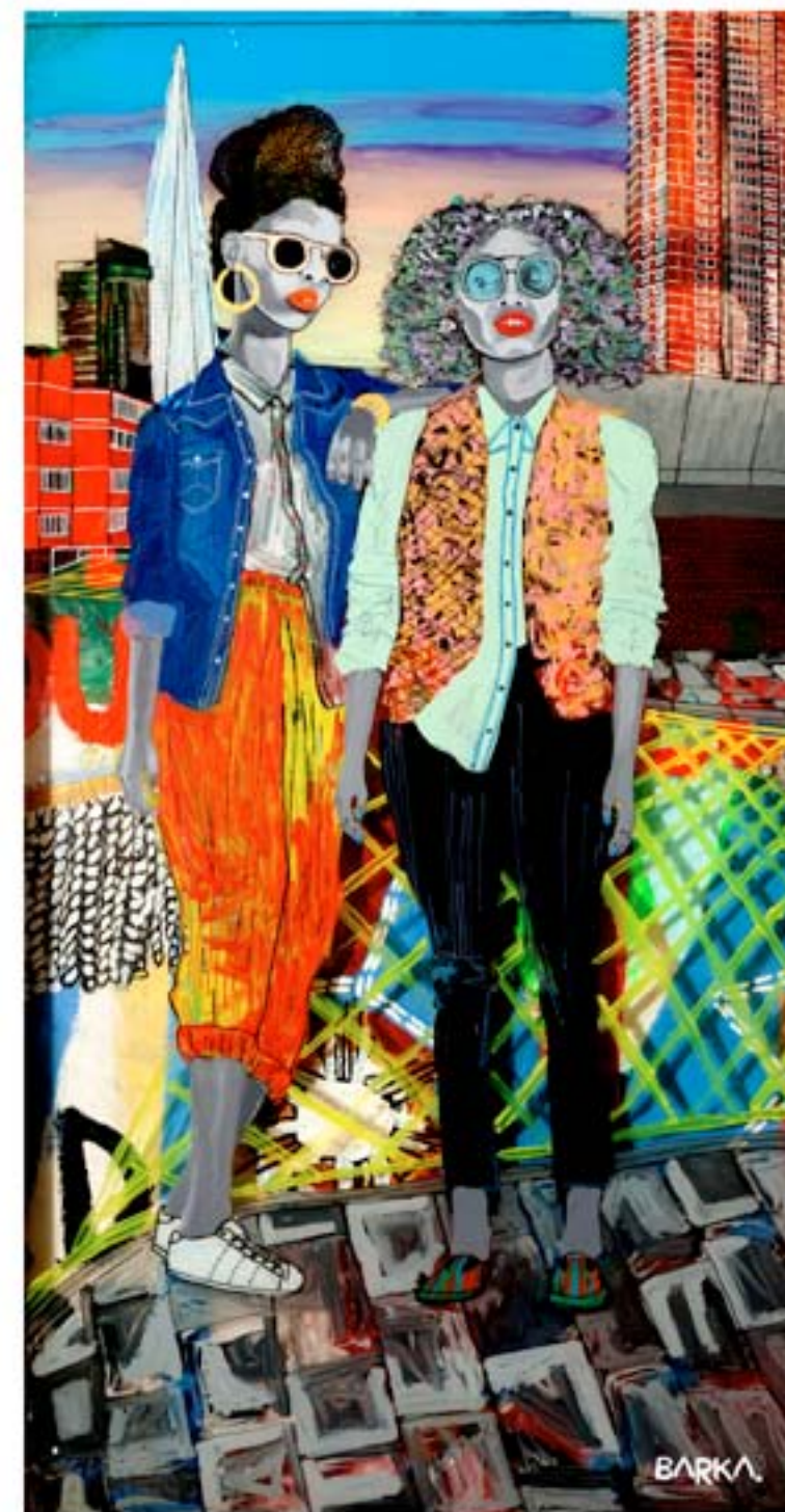
Sister, Sister. 2015 mixed media on glass 113 cm x 83 cm £ 5,000 Ex VAT