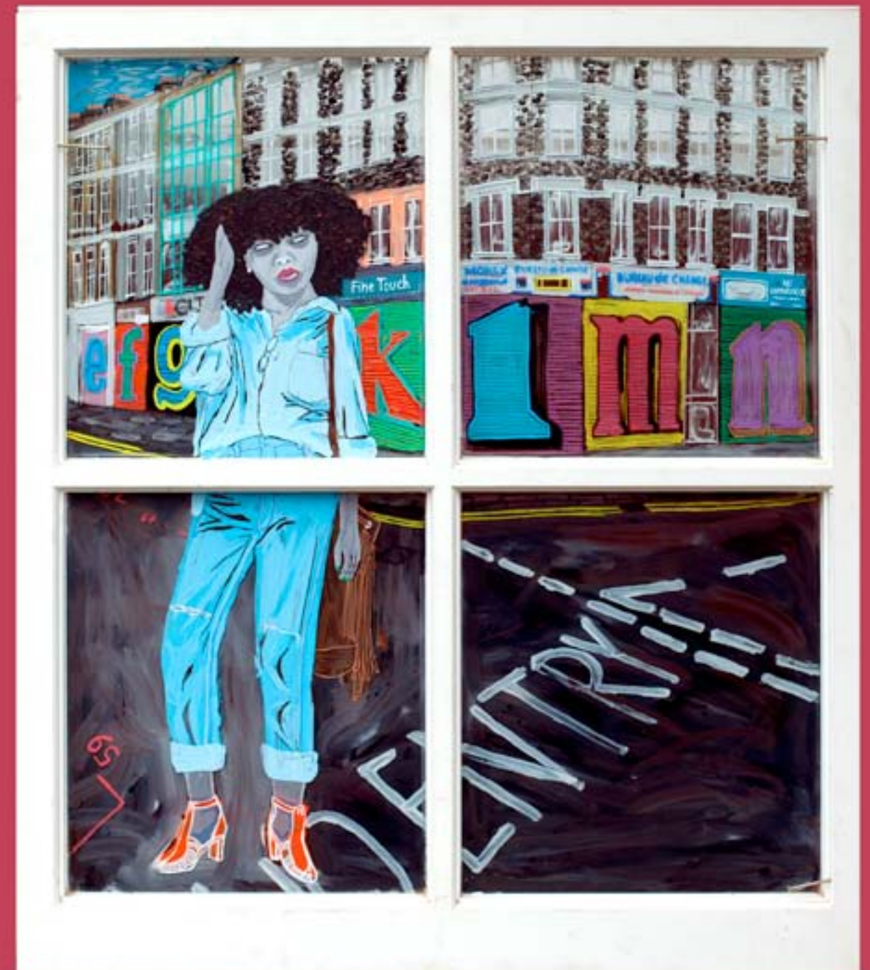
Basics , 2016 mixed media on glass 98 cm x 82 cm £6,000 Ex VAT