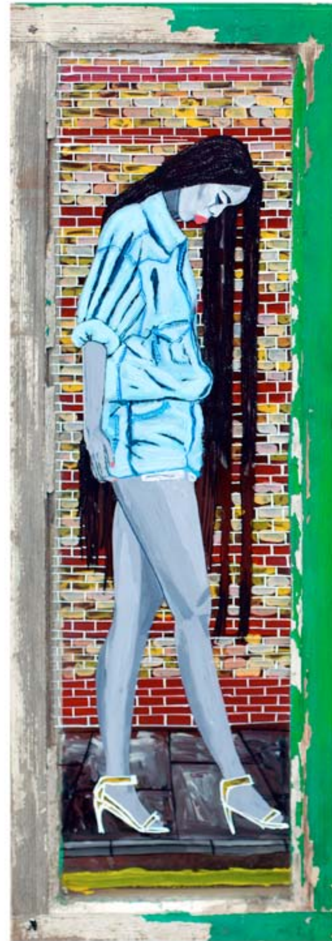
Loner 2016 mixed media on glass 84 cm x 28 cm £3,000 Ex VAT

“the windows are a view into my reality, a contemporary view into how one defines ones identity, ones place in the city, that has shaped that said reality” - Barka