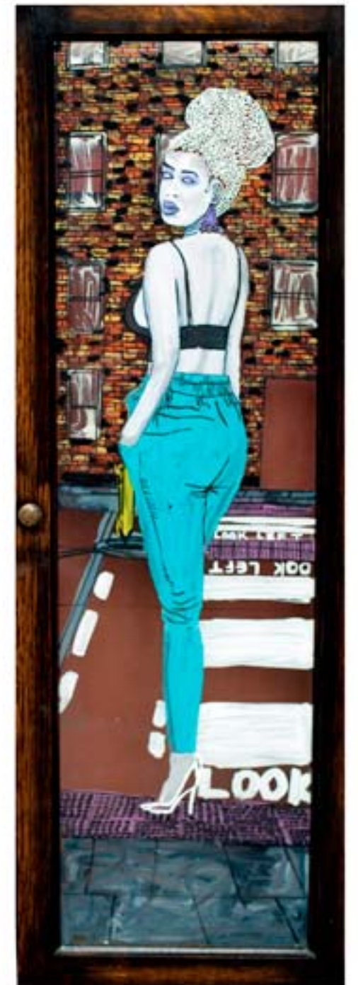
Abbey Street, 2016 mixed media on glass 83 cm x 42 cm £3,200 Ex VAT