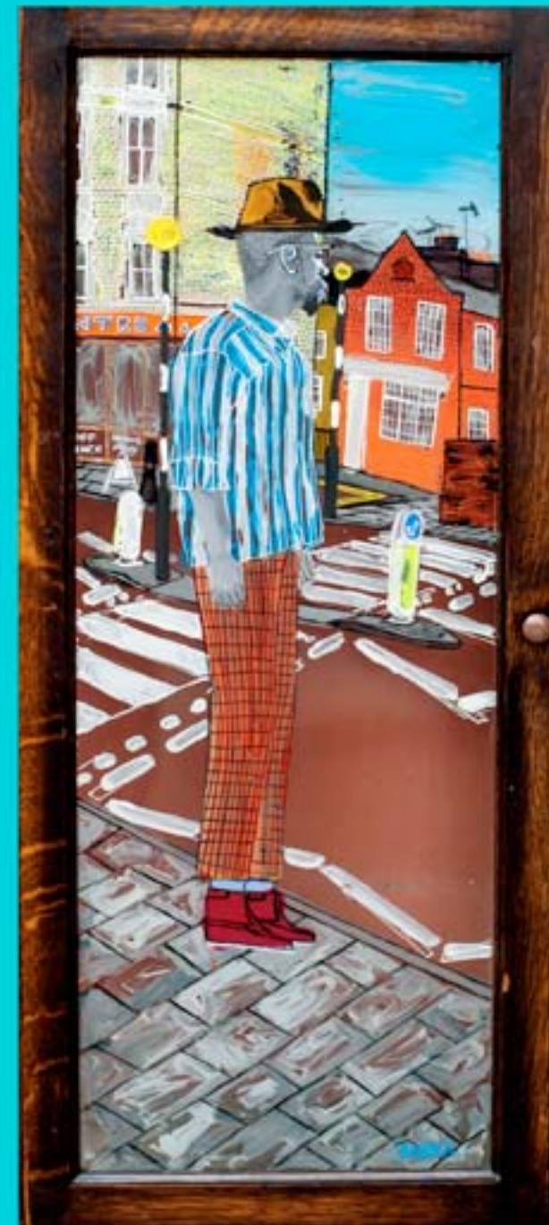
Bethnal Green, 2015 mixed media on glass 83 cm x 34 cm 3,500 Ex VAT

“London is my muse, the muse, every part of her is explored in documenting contemporary narratives in the city.” -Barka