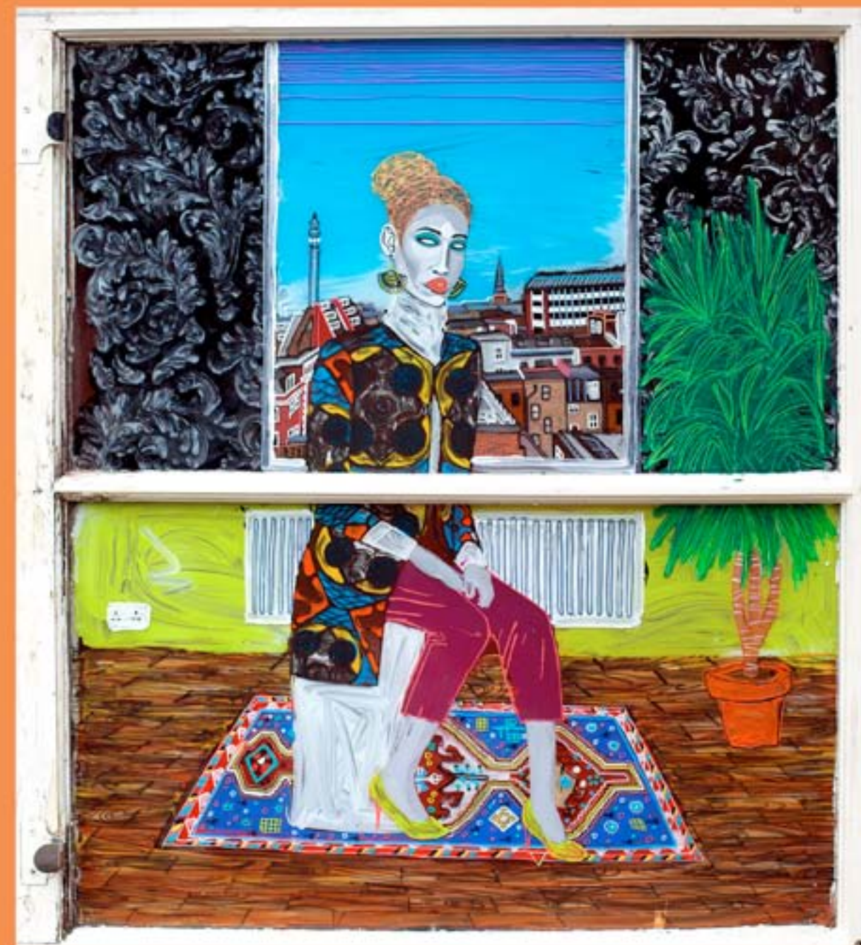
Lady Luck , 2016 mixed media on glass 78 cm x 71 cm £5,000 Ex VAT