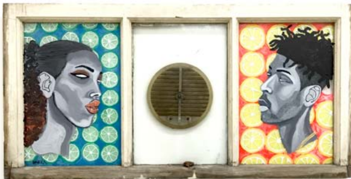
Lemon and lime, Sour 2015 mixed media on glass 92 cm x 47 cm £4,800 Ex VAT