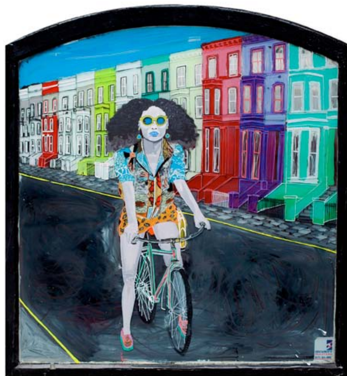
Xylophone 2015 mixed media on glass 101 cm x 91 cm £6,000 Ex VAT