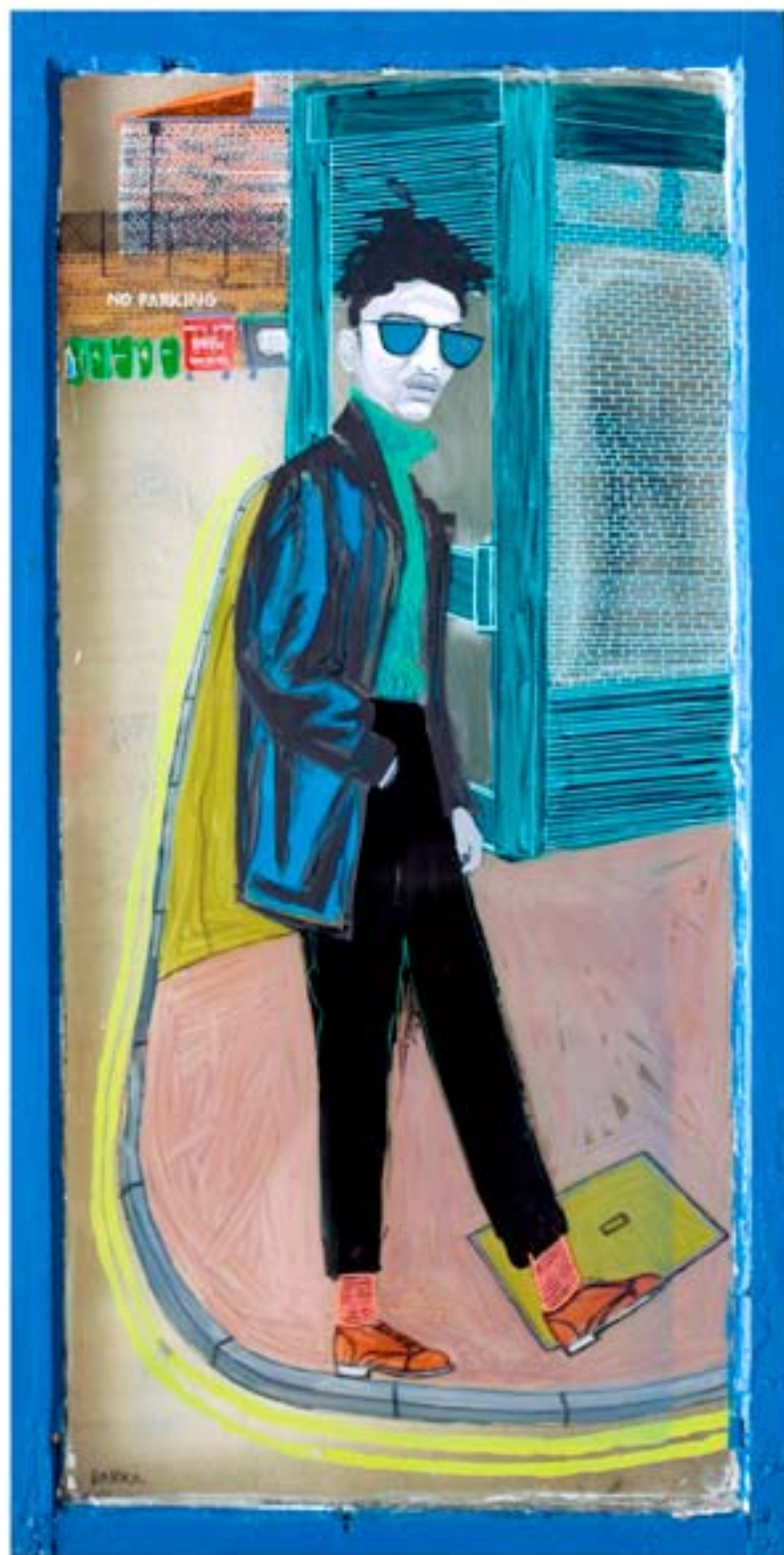
Pecknarm 2015 mixed media on glass 123 cm x 42 cm £4,000 Ex VAT