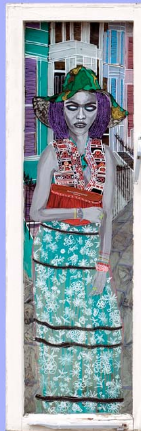
Lavender , 2016 mixed media on glass 123 cm x 42 cm £4,250 Ex VAT