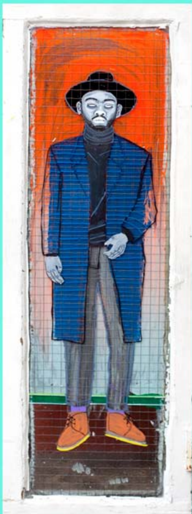
Young Garvey, 2016 mixed media on glass 80 cm x 28 cm £2,700 Ex VAT

Barka Born 1986 in London, UK Lives and works London, UK