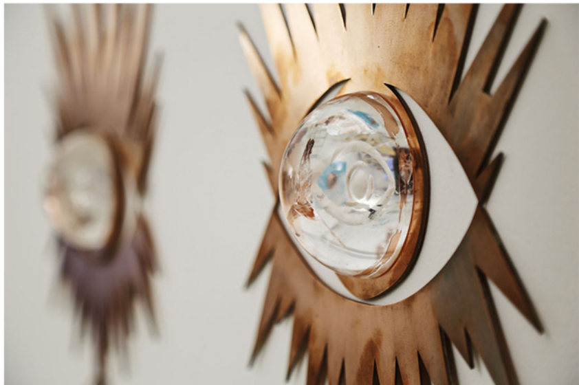
Pole Star , 2016 Copper and Rock Crystal Edition of 8 + 2 AP's, 40 x 27 cm.