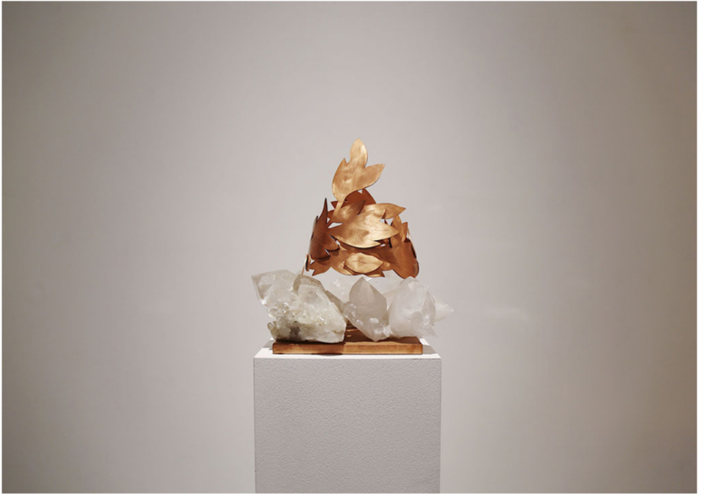
Super Crown , 2016 Wood, Cloudy Rock Crystals, Copper Edition of 5 + 2AP's 18 x 26 x 26 cm.