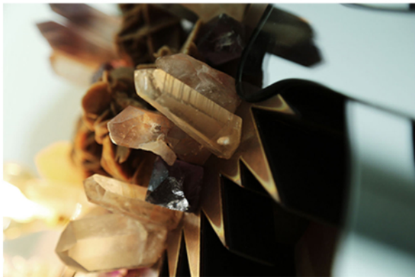
Wheel of Life , 2016 Wood, Leather, Copper, Semi-Precious Stones, LED, Ceramic and Gouache Edition of 2, + 2 AP's 75 x 95 cm.